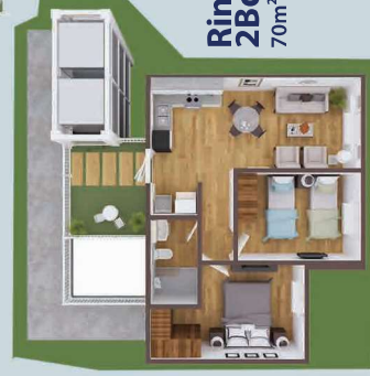
Rincon 2Bdr + 1Bth 70m 2