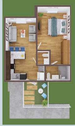
Punta Cana 1Bdr + 1.5Bth 54m 2