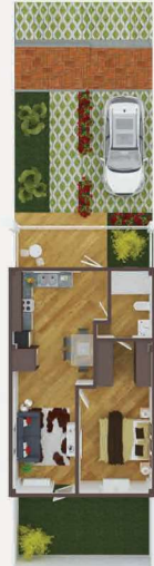
St. John Townhouse 1Bdr + 1Bth / 50m 2