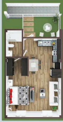
Havana Studio 50m 2