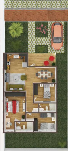
Villa Nevis 3Bdr + 2Bth / 91m 2