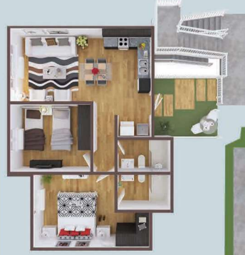
Port au Prince 2Bdr + 2Bth